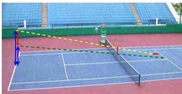
Picture 2. Method of shooting the serve