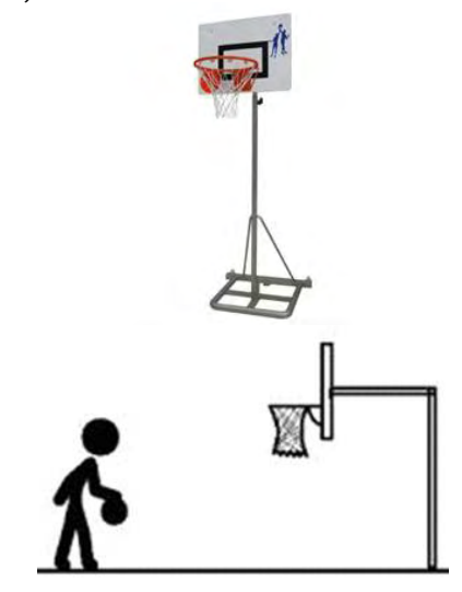
Figure 2 The basket and playing field

The motor task was performed by a distance of 4 meters and the basket placed at a height of 2.00 m (Fig. 2).